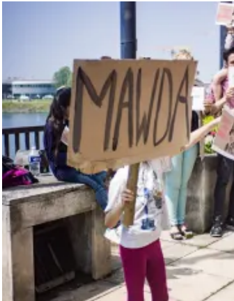
A child protesting